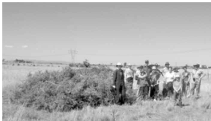
Participants beside one of the three piles of Gorse that they cut and stacked at Craigieburn Grasslands on 26 March